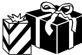
Your heart — the best gift.

If your child does not bring a gift, he will not get a gift & that would be just too sad — I am sure you would agree.