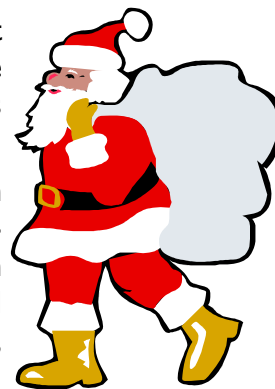
To give is better than to receive!

A classical education allows us to examine great minds throughout the ages to this present day so that we may ultimately come to ask our-