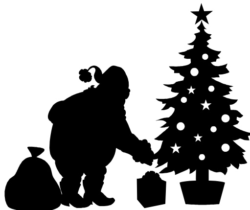
Give the gift of love — Reading to your child!

The two factors most responsible for giving the child the belief that he or she can make a significant contribution to life are parents/teachers and literature . Literature is consid-