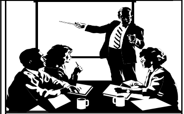
Education...begins in the heart!

riods" when the internal clock was set by nature to do so!